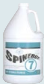
▲ Spinergy 7