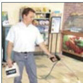
▲ Hydro-Force Revolution

Dilute according to directions. Carefully read and follow all instructions on the bottle.