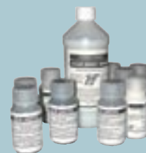
▲ Clear Grout Sealer and dyes