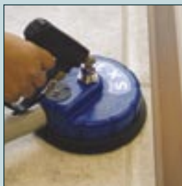
▲ SX-7 hand tool