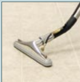
▲ Gekko floor tool