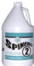
▲ Spinergy 2