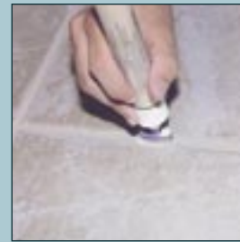
▲ Turbo Stick grout sealing tool