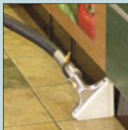
▲ Gekko with Edging/Coving Tool

Use the Gekko stand-up tool for edging and direct blasting of grout. Use the SX-7 for tight spots, countertops or vertical surfaces.