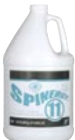
▲ Spinergy 11